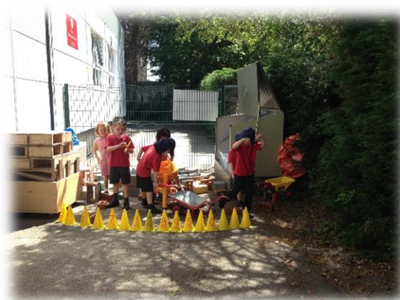
Busy construction site at The Heights