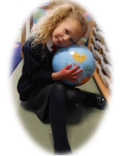
She's got the whole world in her hands